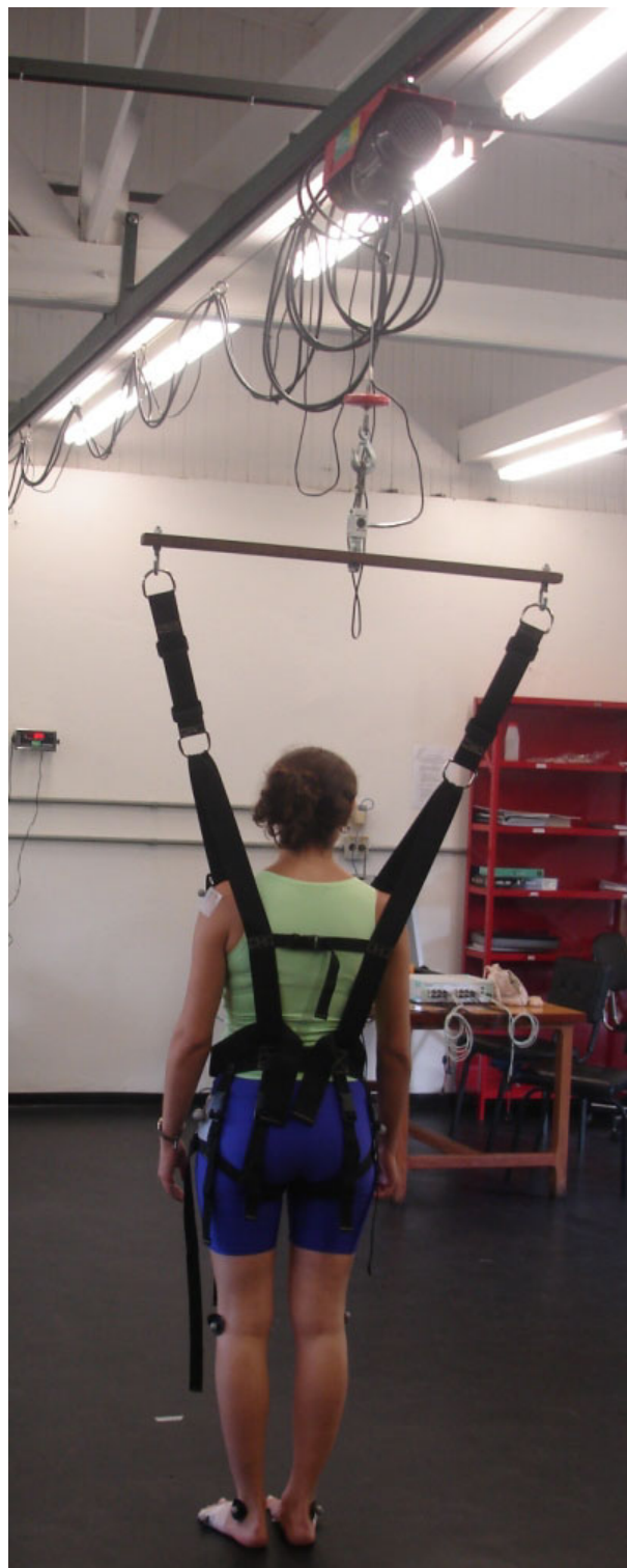
Figure 1 Partial view of the body weight support system used in the study. The rail that the electric motor slides along, the load cell, and one of the experimenters wearing the harness are shown.

All the data were digitally filtered using a 4 th order and zero-lag Butterworth filter and all markers were low-pass filtered at 8 Hz. For joint and segmental angles, strides were normalized in time from 0 to 100%, with a 1% step. These cycles were referenced to the participants' neutral angles measured during the calibration trial in each condition and were then averaged to obtain the mean cycle